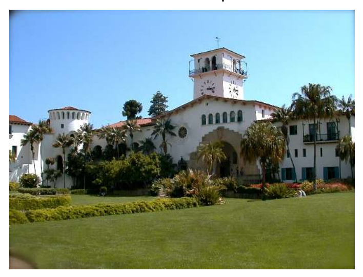
The Santa Barbara Handbook: A Local's Perspective for Tourists and Residents